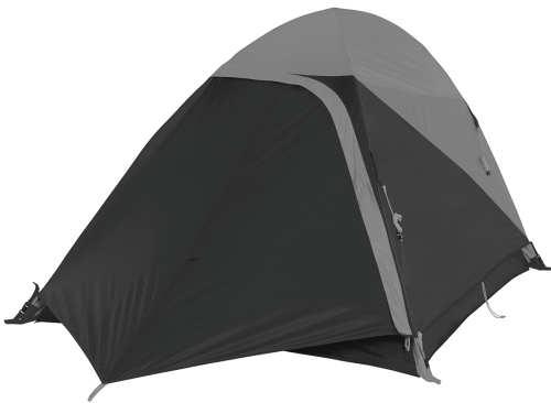
Grand Mesa 2 shown

In order to familiarize yourself with your new tent, we recommend you "test pitch" before your first adventure. For additional information please visit www.kelty.com .