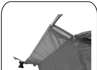
"Quick Corner" fabric sleeves

Insert poles tip into "Quick Corner" fabric sleeve, flex pole and insert the pole tip into opposite Quick Corner. Then repeat for the second pole. Tip: Please ensure each pole is fully seated within each Quick Corner sleeve.