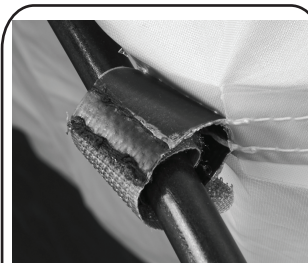
Hook & loop fly pole wrap